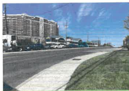
Narrow Sidewalks as Bethesda Trolley Trail along MD 355