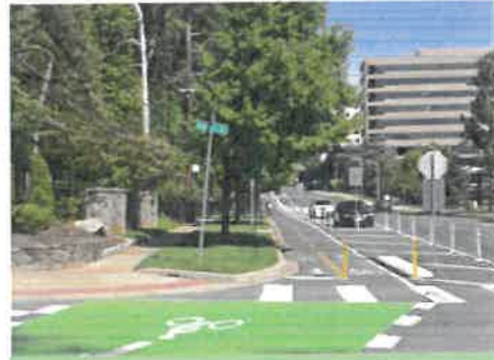
Bethesda Trolley Trail along Woodglen Drive at Edson Lane

MCDOT is conducting this feasibility study to explore alignment alternatives to expand the Bethesda Trolley Trail (BTT) and develop a wayfinding plan to connect to regional trails and surrounding neighborhoods in North Bethesda. This project will evaluate existing and proposed off-road and on-road bicycle facilities between Woodglen Drive & Nicholson Lane to Twinbrook Metro station. The study will also identify gaps in the overall bicycle and pedestrian network in North Bethesda. As part of this project, MCDOT is engaging with stakeholders and community members to gather feedback.