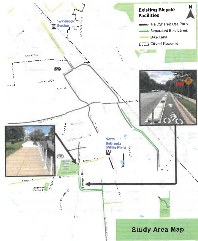
Study Area Map